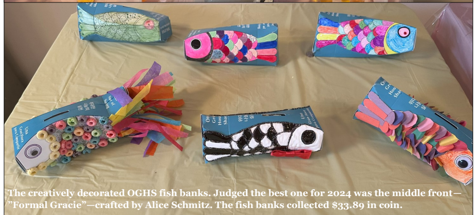
The creatively decorated OGHS fish banks. Judged the best one for 2024 was the middle front—"Formal Gracie"—crafted by Alice Schmitz. The fish banks collected $33.89 in coin.