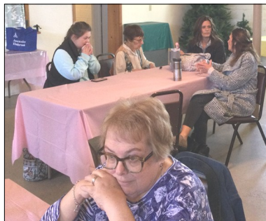
Breakout groups facilitated discussion at the May 4 Congregational Meeting.